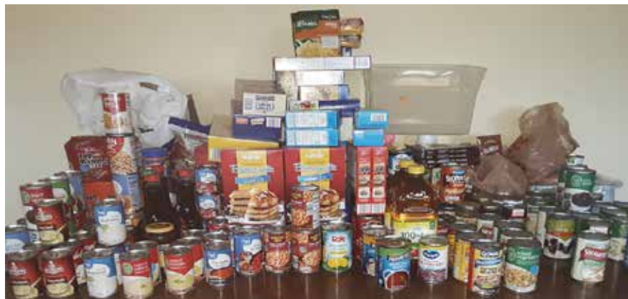
This food, donated by members of Branch 44, was distributed to four families and a food bank in the Akron area during the recent holiday season.

The branch will host a memorial Mass for deceased members at St. Stephen's R.C. Magyar Church in Passaic, NJ on Sunday, March 17 at