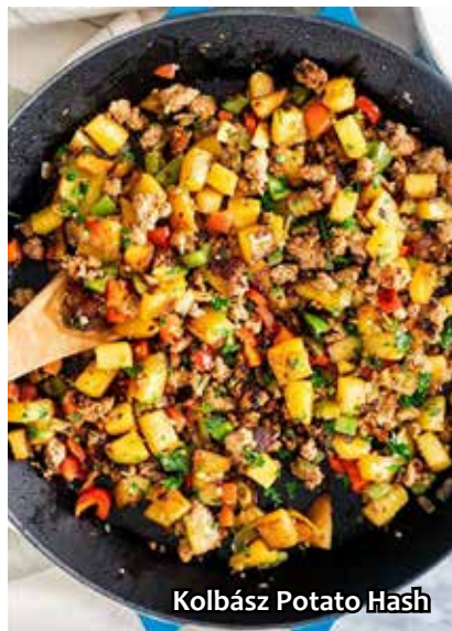
Kolbász Potato Hash

Serve with eggs for breakfast or by itself for dinner.