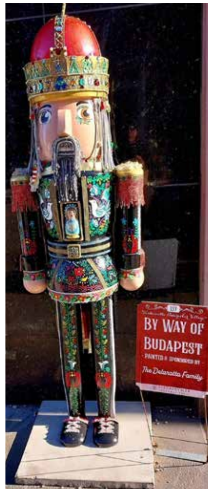
This life-size nutcracker representing Hungary stands guard over the Steubenville (OH) Nutcracker Village.