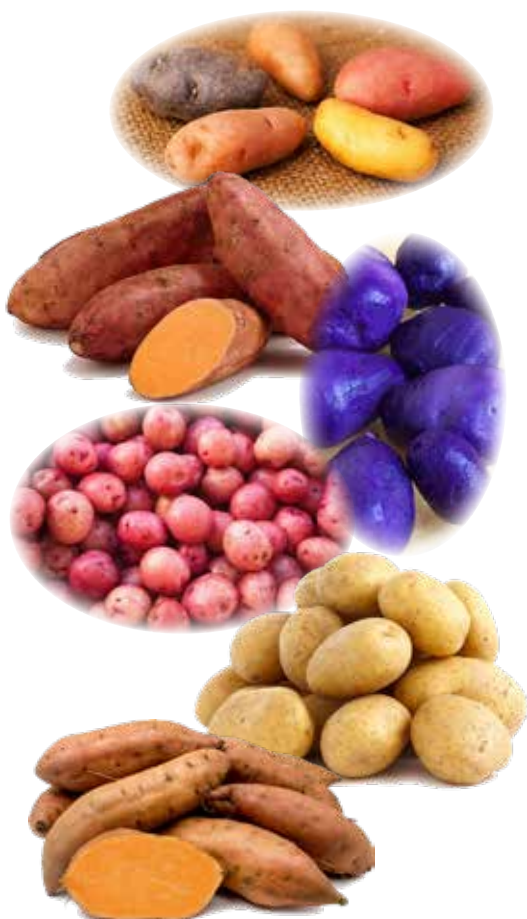
From top: Fingerling, Sweet, Purple, Red, White and Yams