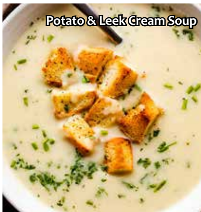
Potato & Leek Cream Soup