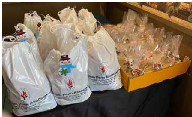
Branch 8 distributed these party favors and gift bags to members who attended their branch Christmas party.