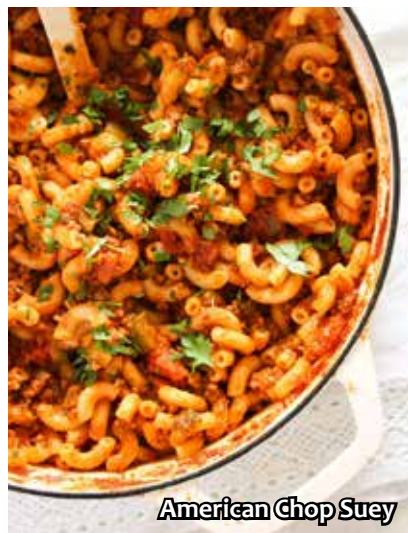
American Chop Suey

In a large skillet, cook the beef until browned then drain the grease. Add seasonings and tomato paste and cook 3 minutes. Add the onions, pepper and celery and cook 3 minutes, then add the garlic. Add the tomato sauce and stir until blended. Add the Worcestershire sauce, undrained diced tomatoes and beef broth, then add the uncooked macaroni and cover the skillet. Cook on simmer until the macaroni is done, about 5 minutes. Adjust to your taste, then serve hot in bowls to your guests. Serve with cheddar cheese as a garnish.