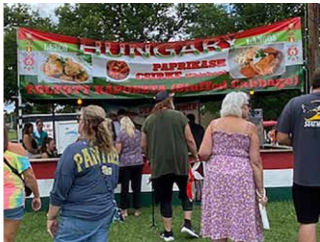
Guests line up at the Hungarian booth at the annual International Village held at Renzie Park in McKeesport, PA.

Don't forget to celebrate. Break out the good China now and then and drink the good wine for no reason. Dance at weddings until your feet are sore and tell your partner you love them every night before falling asleep.