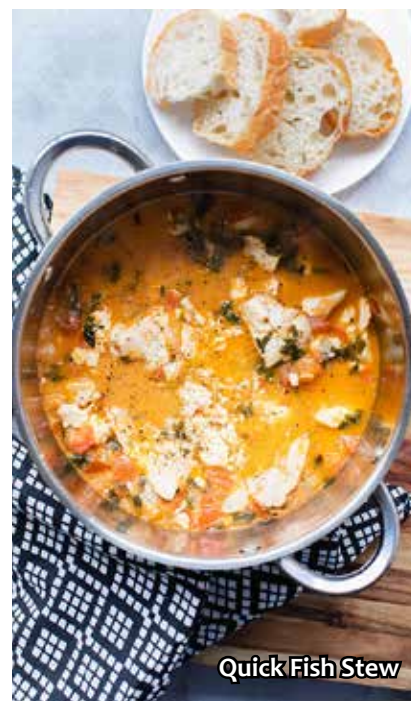
Quick Fish Stew