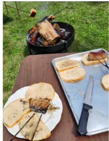
Guests at the Branch 226 picnic this summer were invited to partake in a traditional Hungarian bacon roast.