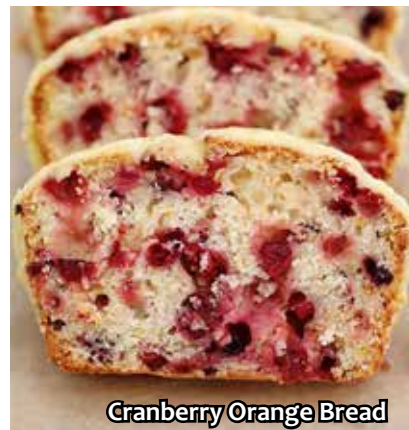
Cranberry Orange Bread

Remove rolls from oven and brush tops with melted butter.