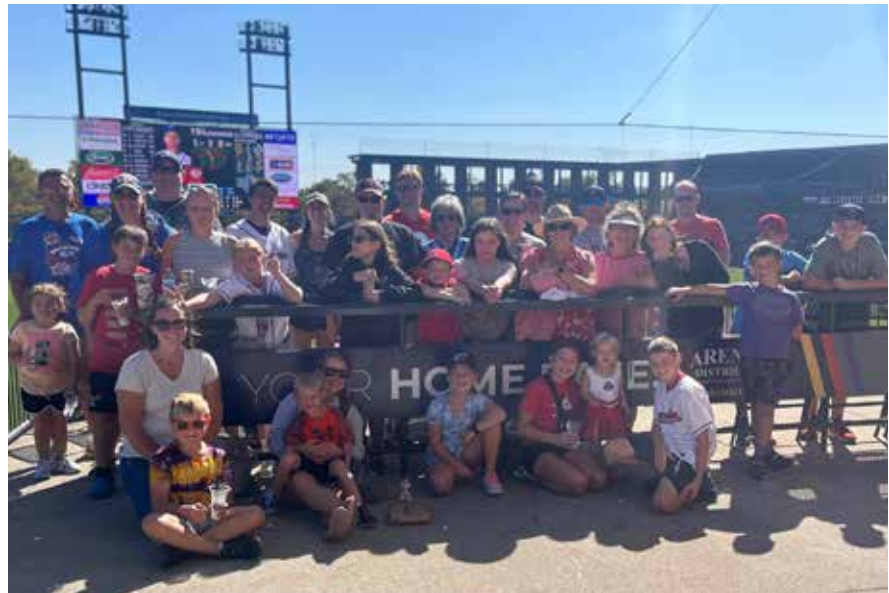
Members and guests of Branch 129 gathered for a fun afternoon of baseball and fellowship Sept. 23 when they attended a Columbus Clippers game.

Our annual Christmas party will be on Saturday, Dec. 16, at noon at Spins Bowl. It will be cosmic bowling, and we also have obtained the