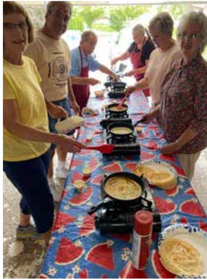
Branch 8 members prepare kielbasa and lecsó (left) along with 700 palacsinta (right) for the annual Slavic Fest held in Johnstown, PA.