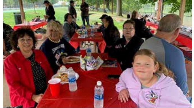
Despite an all-day rain, members and guests enjoyed the annual bacon roast hosted by Branch 296 this September.

started, but no; here we are at the end of another year. Halloween and Thanksgiving have come and gone and Christmas is just a few weeks away.