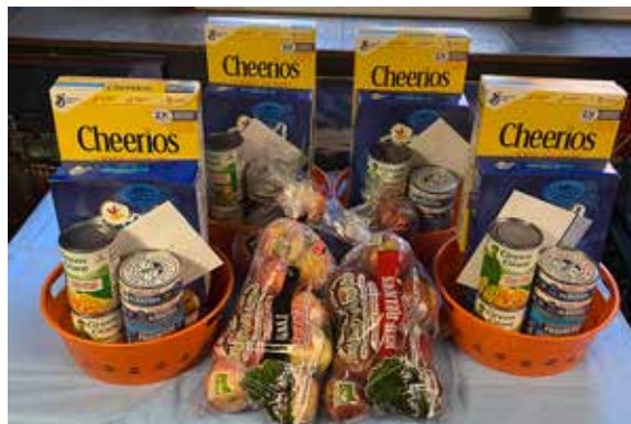
Members of Branch 1 prepared four baskets of donated food as part of WPA's Holiday Basket program.

Then, it was time to prepare for the Slavic Fest. The Fest is getting bigger and better every year. We made over 700 palacsinta, and they were a hit, along with our