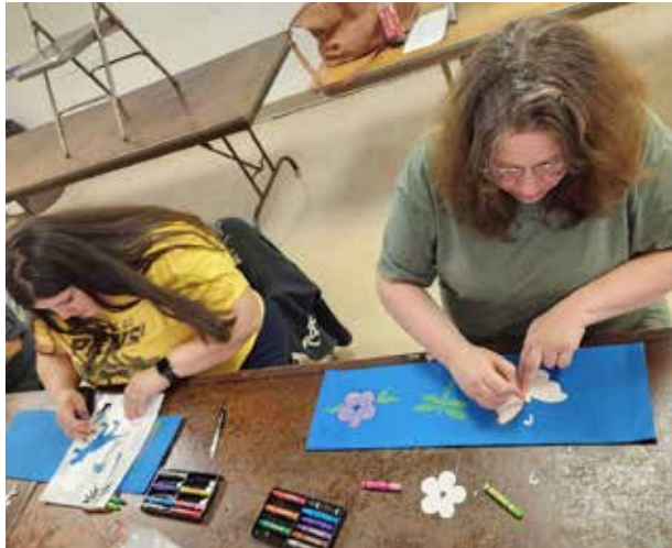
For their Join Hands Day project, members of Branch 226 decorated duffel bags to be given to foster children in the McKeesport, PA area.

fraternal event shared with family and friends.