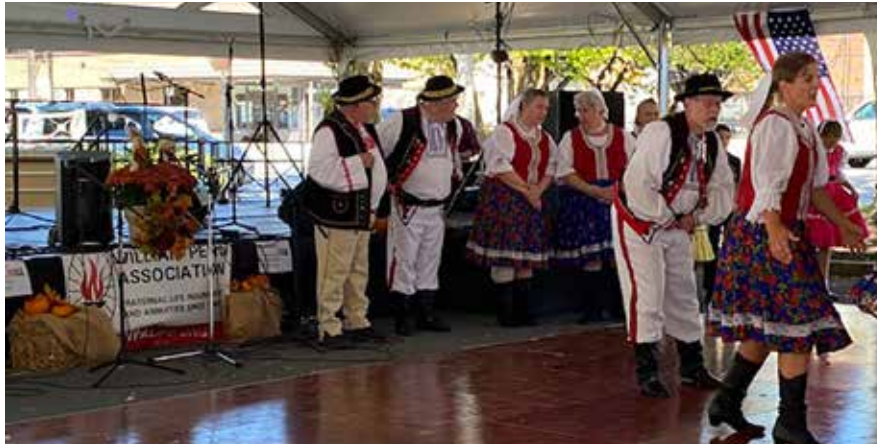
William Penn Association was a proud supporter of the Johnstown (PA) Slavic Festival, which included a performance by the Pittsburgh Slavic Dancers (above).

even a Kennywood Park amusement ride. He is considered a symbol of strength and endurance, but also a reminder of the harsh conditions that the steelworkers faced in the past. He is sometimes compared to Paul Bunyan, another mythical American hero who performed extraordinary feats.