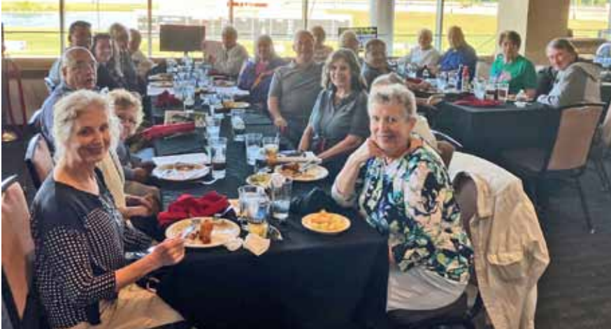
Members of Branch 249 enjoyed an Adults Night Out this October at Hollywood Gaming at the Dayton Raceway.

mas and Happy New Year, or in Hungarian: Kellemes karácsonyi ünnepeket és boldog új évet kívánunk!