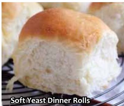
Soft Yeast Dinner Rolls

1½ bunches fresh thyme, chopped ½ cup garlic, minced 1 cup fresh parsley, chopped ¼ tablespoon black peppercorns, freshly ground ¾ tablespoon kosher salt ½ cup vegetable oil