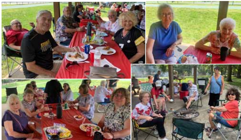
Members and friends of Branch 296 gathered Sept. 18 at Riverview Park in Oakmont, PA for the branch's first bacon roast since 2019.

Looking back at 2022, Branch 296 was able to return to a more regular meeting schedule. Our bacon roast also returned, and everyone had a great time. It is always a pleasure seeing familiar and new faces. Thank you to all who joined us and contributed