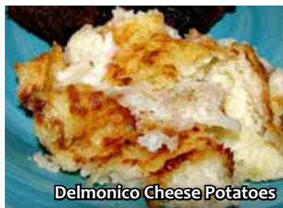
Delmonico Cheese Potatoes

Bake in the oven until potatoes are soft, about 60 minutes. Remove from oven, stir the potatoes, then sprinkle with cheddar cheese and put back in oven for 5 minutes until the cheese melts. Serve hot to your guests as a great side dish.