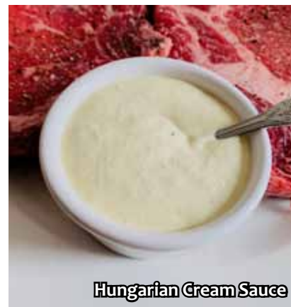
Hungarian Cream Sauce

In a mixing bowl, combine all the ingredients together, then refrigerate or serve to your guests with roast beef or prime rib.