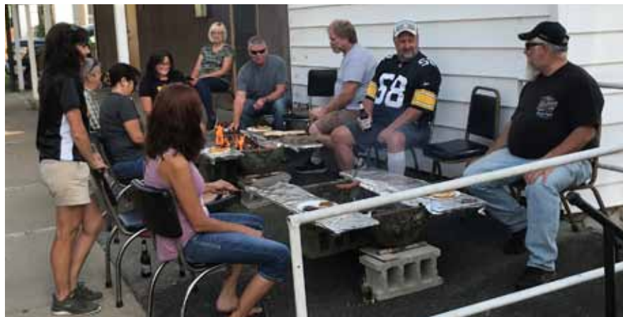
Members and friends of Branch 88 gathered Sept. 18 for the branch's annual bacon and sausage roast.