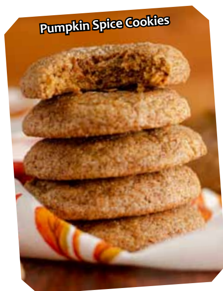
Pumpkin Spice Cookies

F áradjon be a Magyar Konyhába! Another year has passed and we get to enjoy the end of year holidays. While a lot of things may change in our lives, what stays constant are family and friends. As we end 2022, let me express my gratitude to William Penn Association for giving me the opportunity to share my recipes with you. It is a pleasure to share recipes and techniques so we all can appreciate food and all it offers us: nutrition, health and nourishment! This issue, I am sharing recipes for appetizers, side dishes and desserts for your dining enjoyment this holiday season. On a final note, The Hungarian Kitchen will be expanding its horizons. Stay tuned for our next issue. In the meantime, enjoy the recipes and have a wonderful, safe Holiday Season.