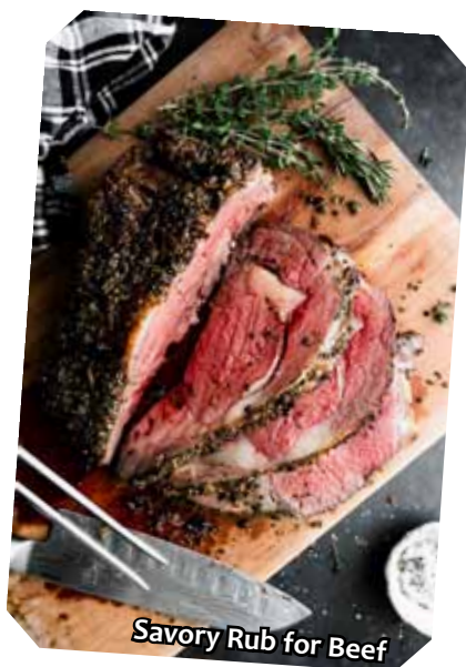
Savory Rub for Beef

Remove from heat, add the pecans, bourbon and vanilla extract. Stir well and serve over the bread pudding.