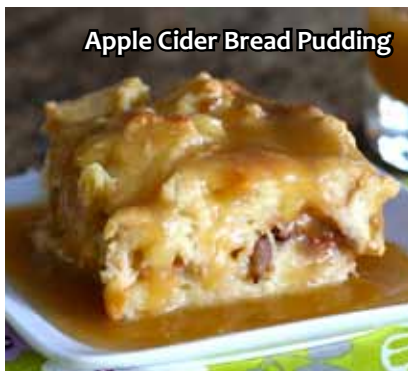
Apple Cider Bread Pudding