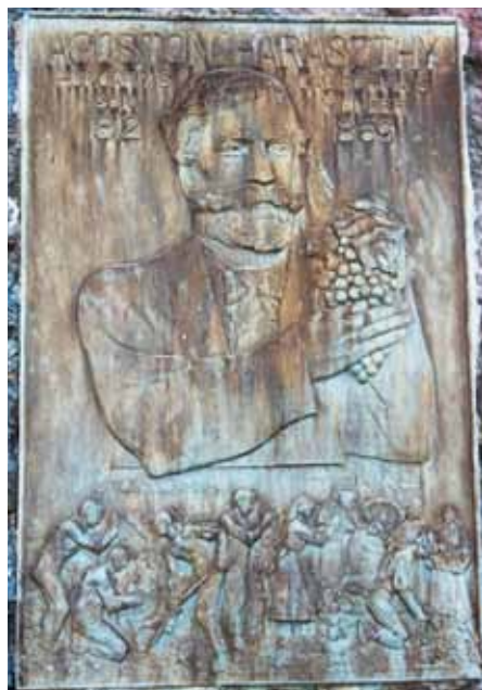
This bronze plaque of Agoston Haraszthy adorns the grounds at the Buena Vista Winery.

would help us avoid any microbial trouble. San Diego seems like a world unto itself, with beautiful sunshine and aromas of sea foam, desert flowers, cypress, and pine (at least at higher altitudes). I could see why Haraszthy found himself in San Diego, and by force of his personality, the first sheriff of the fledgling city.