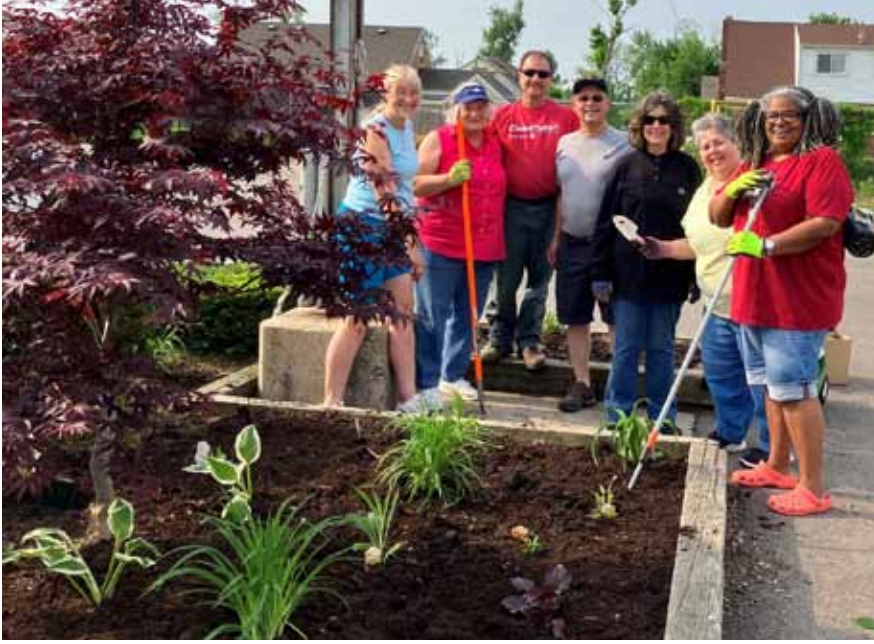
For their Join Hands Day project, the members of Branch 249 partnered with the Magyar Club of Dayton and the American Czechoslovakian Club to weed, trim bushes and plant flowers at Queen of Martyrs Church in Dayton.

urgent needs of those who are suffering. It was so encouraging to see the first phase of donations and our members' generosity as a shining example.