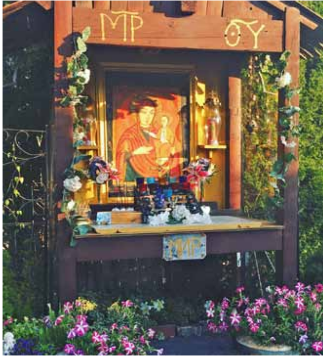
For their Join Hands Day project, members of Branch 8 placed flowers at this shrine dedicated to Our Lady of Mariapócs, located at St. Emerich Roman Catholic Church in Cambria City, PA.

We continue to pray for peace and the people of Ukraine. May God protect them and bring light to the world.