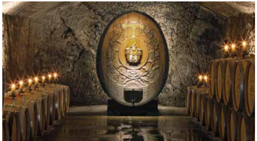
The Haraszthy family crest keeps watch over the wine cellars at Buena Vista Winery.

Perhaps there's something in the earth or the air that attracts Hungarians and those of Hungarian extraction to San Diego, because when I first visited that city in the fateful month of February 2020, I was entranced. A buddy of mine (who incidentally spent his early career patrolling the mountains and valleys along the U.S.-Mexico border) and I were traveling for work, and, given that a little thing called Coronavirus seemed to be making its way across the Pacific, we thought that flying to the smaller San Diego airport (as opposed to the globally-connected LAX)