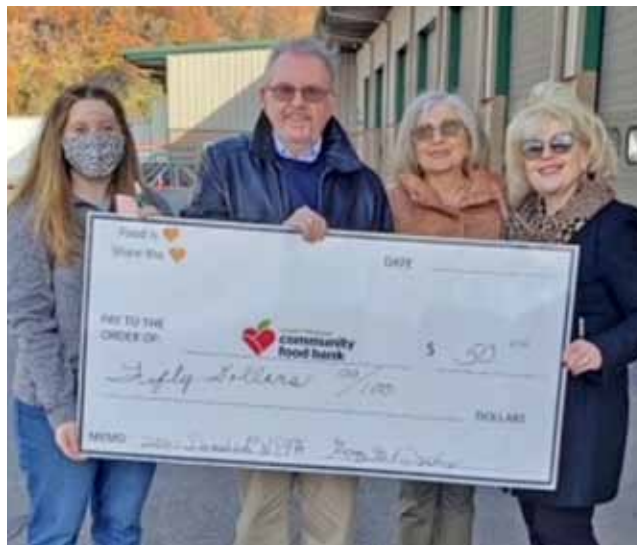
Members of Branch 34 made a donation to the Greater Pittsburgh Community Food Bank, one of several charitable donations made by the branch over the holiday season.

An election for Branch 44 officers was held, and members renominated and reelected your