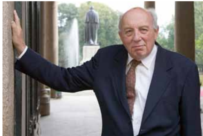
The late author and historian John Lukacs

There are so many facts that I never knew about Hungary and Budapest which Lukacs explains in a leisurely manner. He tells about how Teddy Roosevelt visited Hungary after reading the book Saint Peter's