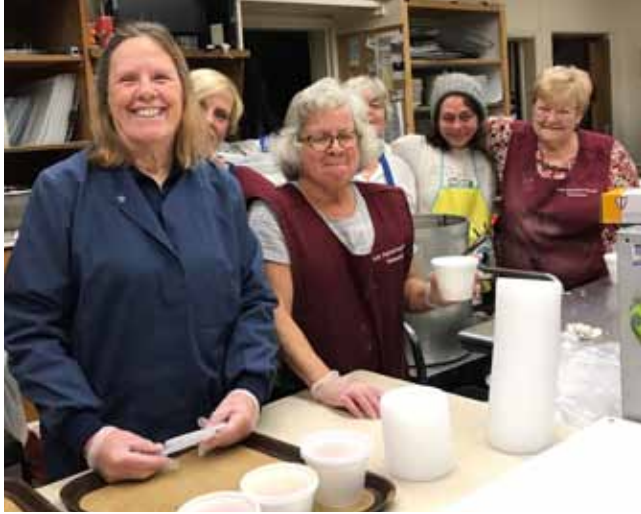
Members of Branch 28 were among the volunteers at Holy Apostles Parish in Youngstown who prepared and served meals to those in need during the week following Thanksgiving.

With the support of the Home Office, branch Christmas parties were able to be held this past Christmas season. Branch 28 was anxious to do something for our members, so the officers decided to host a drive-thru event on Dec. 4. We are thankful for Holy Apostles Parish, St. Stephen of Hungary Church for allowing us to use their garage and parking lot for this event.