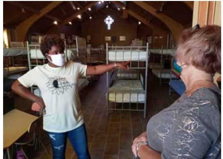
Members of Branch 18 recently delivered clothing, household goods, food and personal hygiene products to the Oaks of Righteousness and Oaks Village in Monroe, Mich., where they were given a tour of the clothing storage area (above left) and one of the sleeping facilities (above right).