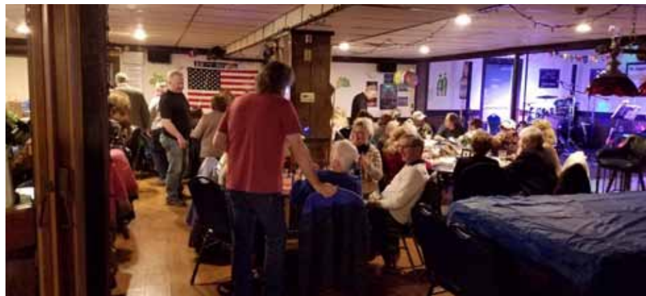
Members and friends celebrate several birthdays last month at the club in Harrisburg, Pa.

Faxed or emailed applications and essays are not acceptable; all submissions must be placed in the mail! In fact, sending them by certified mail is actually the best option, as it ensures that our Home Office receives what you've sent, including