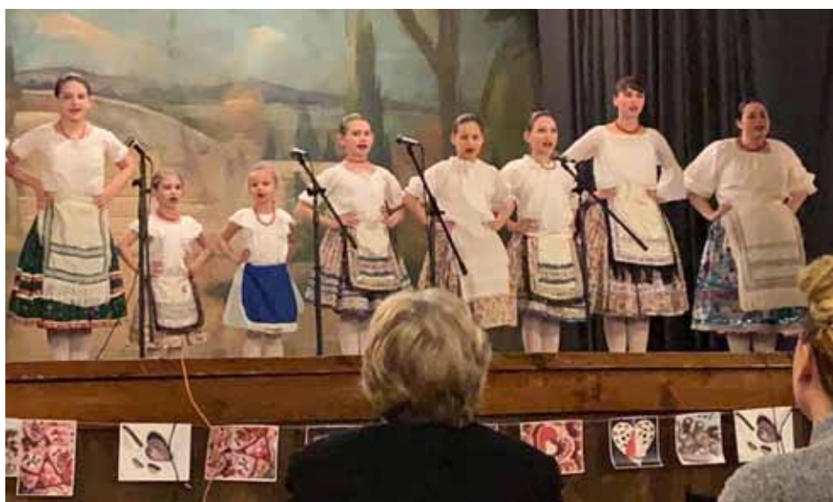
The William Penn Association Magyar Folk Dancers perform Feb. 15 during a multicultural youth dance concert hosted by the Pittsburgh Bulgarian School "Otets Paissii."

struggling with food hardship. The Foodbank supplies over 100 local food pantries, allowing each pantry's supplies to reach even further to help those in need, especially those affected by last year's 15 tornadoes. Physical recovery is slowly taking place but with the financial strain that rebuilding causes, food resources for families are stretched even further, and every dollar or can of food helps tremendously.