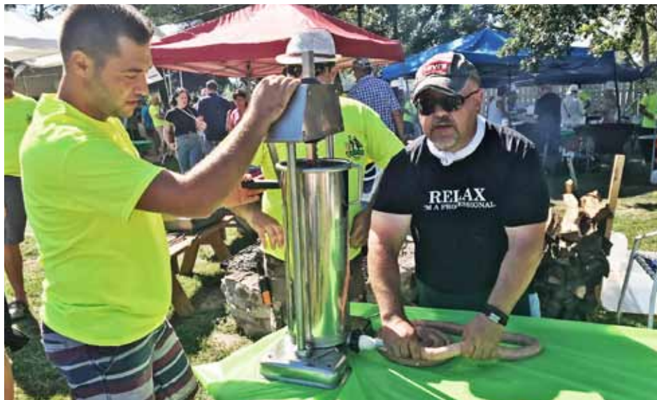
Members of Branch 15 had the chance to watch Hungarian sausage being made during the Taste of Hungary Picnic held this summer.

This year has gone by very quickly as always. We still talk about last year's Christmas party, and here we are planning 2018's party. Last year, we had members come who had not attended before, and they had a wonderful time. It's very heart-