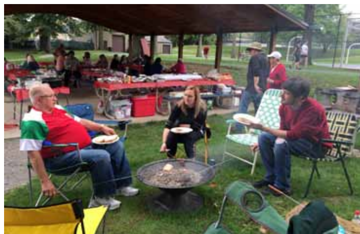
Members and guests enjoyed a traditional Hungarian bacon roast hosted Sept. 23 by Branch 296 at Riverside Park in Oakmont, Pa.

new friends made and enjoying many covered dishes and desserts. Wish I could have been there.