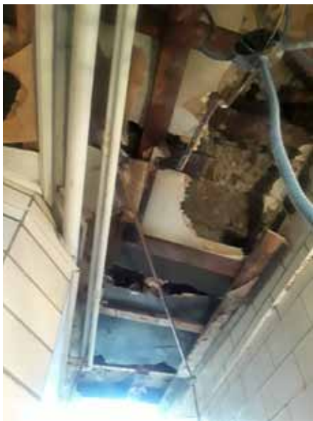
Branch 89 is trying to raise funds to repair the above-pictured damage at the First Hungarian Reformed Church which was caused by recent severe storms.