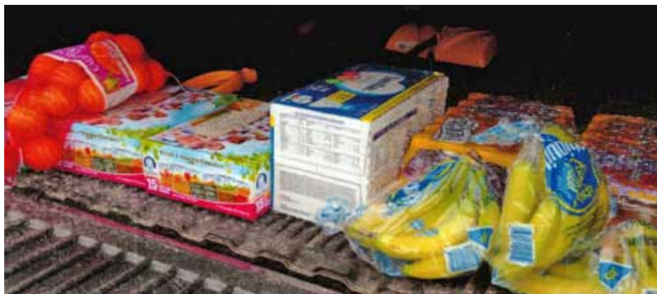
Fresh fruit, baby food and formula donated by Branch 1 were delivered to the United Congregational Church Food Pantry as part of WPA's Join Hands Against Hunger campaign.