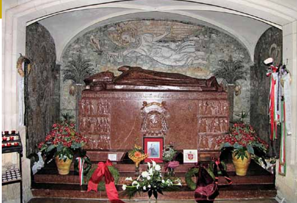
The tomb of Blessed Vilmos Apor in the Basilica of Győr.

other struck his arm and the third hit his abdomen.