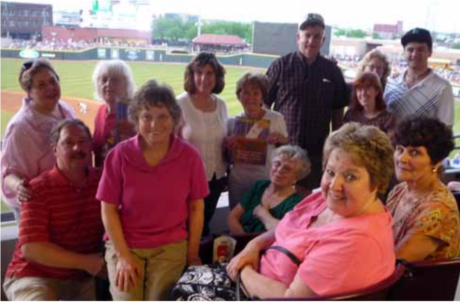
Members and friends of Branch 249 enjoyed the comforts of a luxury suite while watching the Dayton Dragons minor league baseball team play May 8.

Keep our military, here and abroad, in your thoughts and prayers.