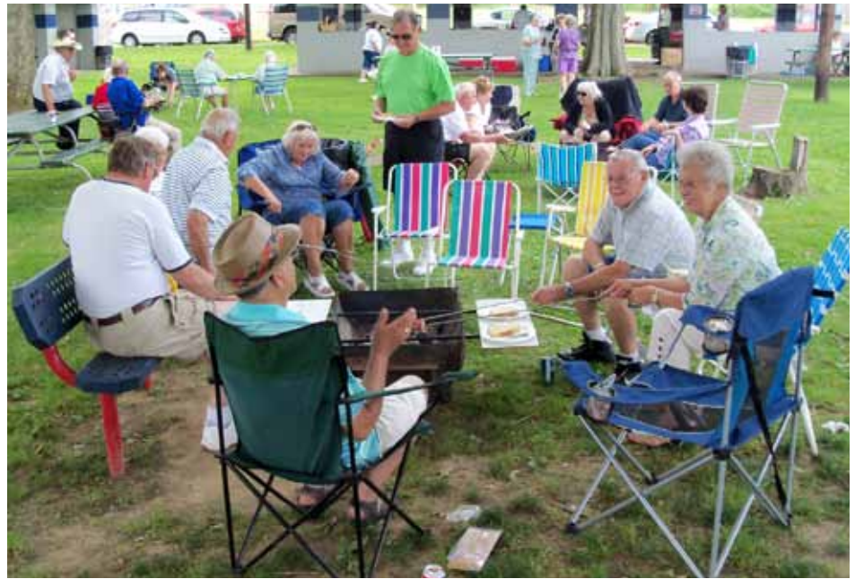
Members enjoy an old-fashioned szalonna sütés (bacon roast) June 2 during a picnic sponsored jointly by WPA Branches 10, 40, 248, 349 and 8164 and the Ohio Valley Hungarian-American Cultural Society held at Warren Township Park in Yorkville, Ohio.