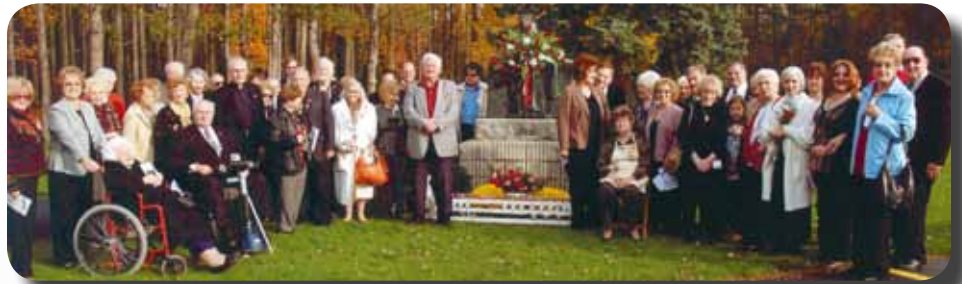
Members of Branch 28 gather around the eternal flame and statue commemorating the Hungarian Revolution of 1956.