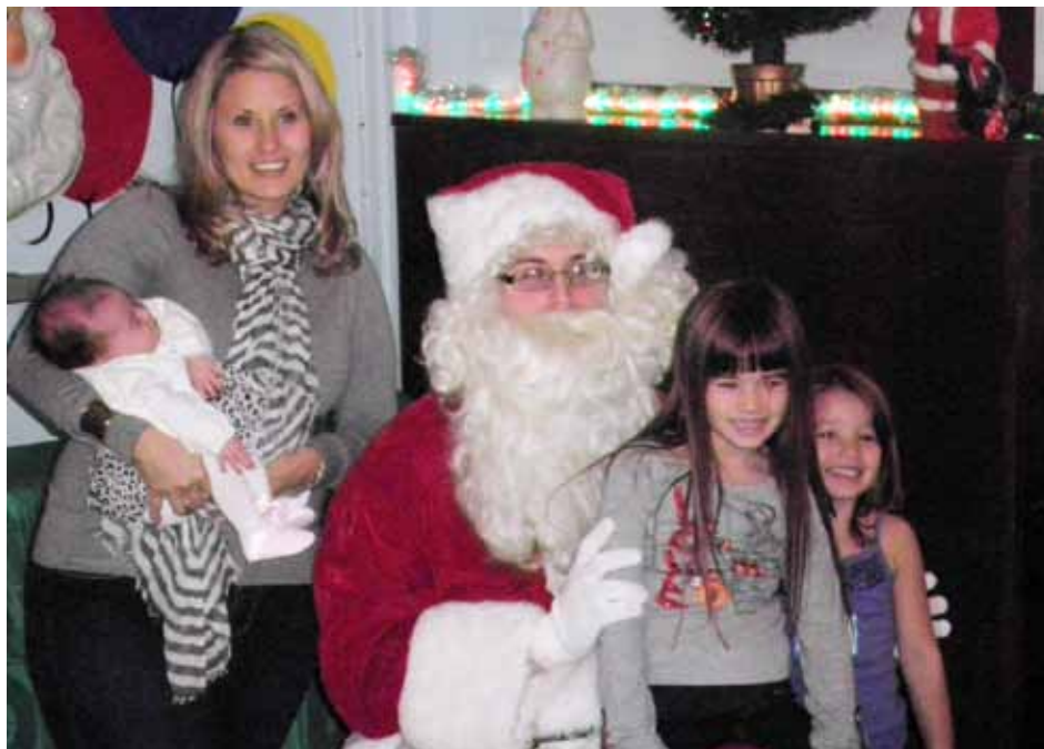
Santa welcomes members to Branch 352's annual family Christmas party held Nov. 20.